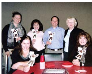
Franklin Pierce at Manchester