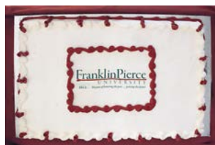
Franklin Pierce at Rindge