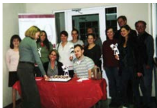
Franklin Pierce at Portsmouth