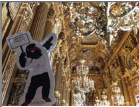
Here's Rocky at the Paris Opera.

Rocky has been traveling the world during our 50 th Anniversary year! The photos below show some stops he made in Paris. Take a look at our photo album of Rocky around the world at: www.franklinpierce.edu/50/rocky_photos