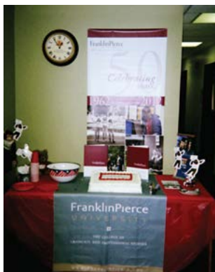
Franklin Pierce at Lebanon