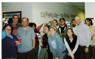
Franklin Pierce at Concord